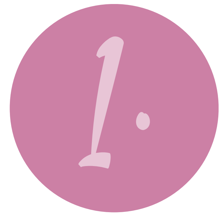
TABLE DISCUSSION QUESTIONS:

What is your favorite Full Makeover, House Renovation or Style Show? Why do you like it?